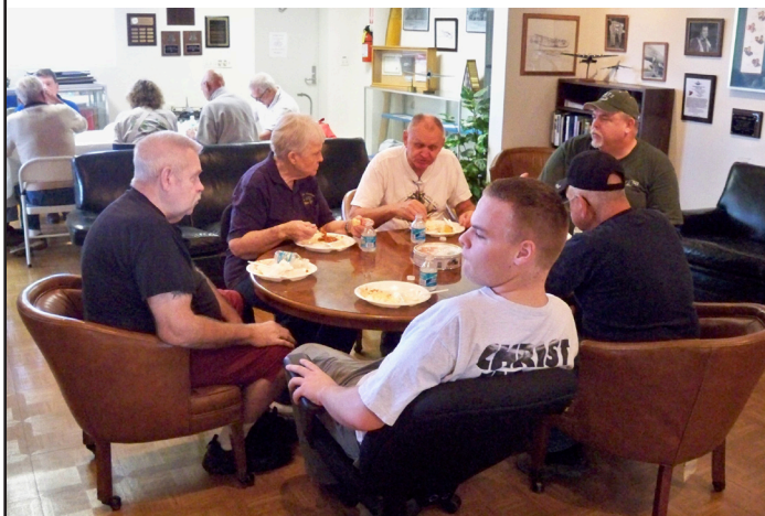
Our January Birthday Party